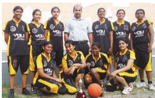
Basket Ball Team

VolleyBall winners: MBC Trophy, FOTIOS 2k15 fest at Caarmel Engg College, PACE 15 fest at SJCE, Pala