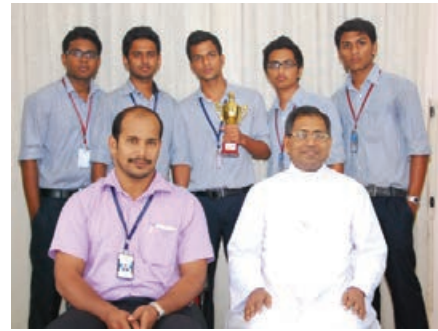
Table Tennis Team